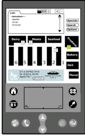
Figure 4: The formative evaluation redesign

The evaluation uncovered several interesting items. Perhaps the most important was the fact that participants who were unfamiliar with how to use a PDA offered mixed responses. On one hand they could not "traverse" the interface in a manner required when using a PDA. As a result, they limited their actions to what they knew they could do with a mouse on a computer. On the other hand, because they were not limited by knowledge of how to interact with PDAs, they offered insight through their interpretations and comments. Additional findings were: