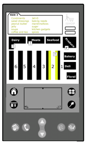
Figure 2: The spatial design