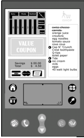
Figure 3: The contextual design

Clearly, PDA displays have extremely limited space. The merging of the desired features from both the spatial and contextual interfaces presented design obstacles. We would have to use pop-up windows that would, at different times, occlude the main interface. Designers for handheld devices refer to this as "deck stacking". It is a metaphor commonly used on small screen real estate.